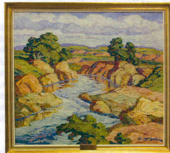
Birger Sandzén, "Kansas Landscape" Oil on board; loaned by USD 382